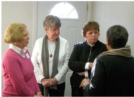
Minerva talks with visitors.