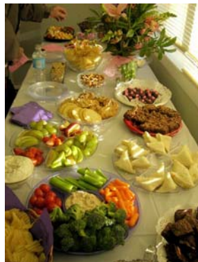
Some snacks were prepared by volunteers.

Following the dedication ceremony, there was a reception where friends had the opportunity to chat and share fellowship. Tasty snacks and drinks were served. We thank everyone who helped us prepare for this reception and make it special for a very special man.