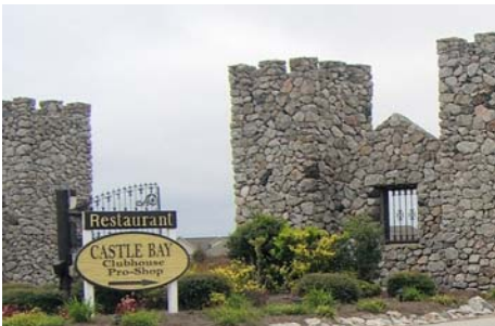
Castle Bay Golf Club, Hampstead NC