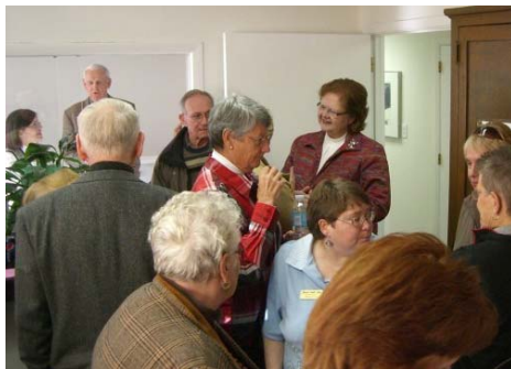
Fellowship and conversation followed.